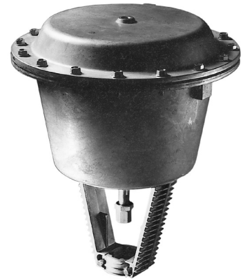
Flowrite 12-inch Pneumatic Valve Actuator.